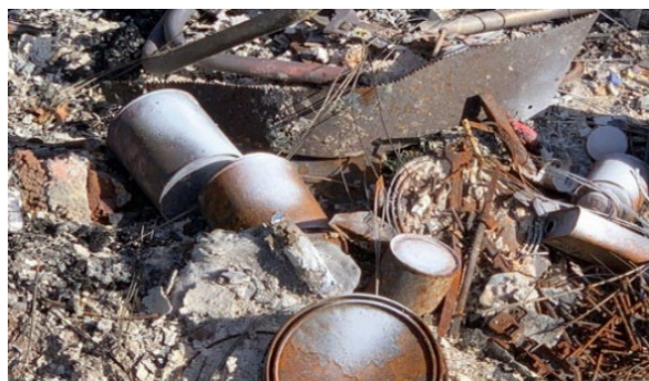
Examples of hazardous materials that will be removed.