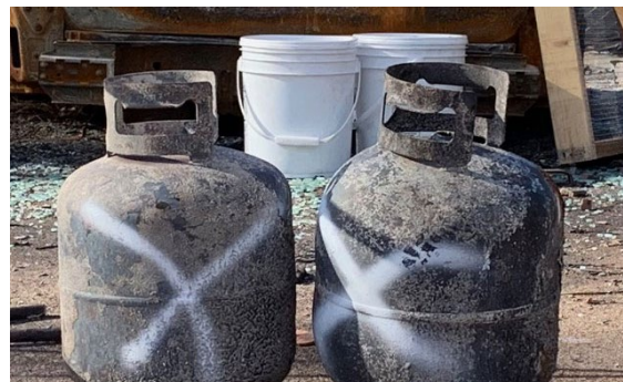
Empty containers EPA inspects will be marked with a white X, made safe, and left to be removed during Phase 2.